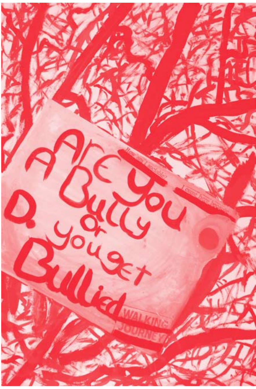
The year 9 Art pupils then looked at the postcards and put some more in the trees and railings. Pupils worked on the postcard answers and responded to them by integrating the postcard themes into art using all kinds of media – crayon, chalk, ink, pencil, charcoal. Here’s one where bullying was an important question.