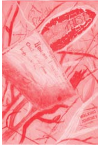
Having places to chill out and be with friends seemed a recurring theme.